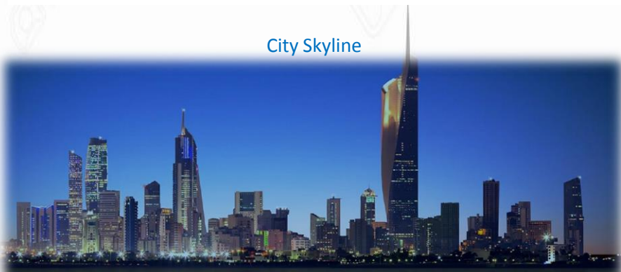
Some Interesting Pictures of Kuwait from Heleen and Herman Baars